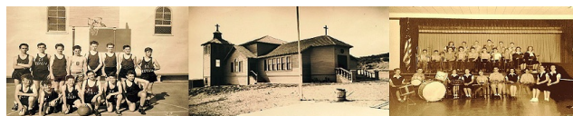
Photo Archive Displays

There are only a few photo displays left in this